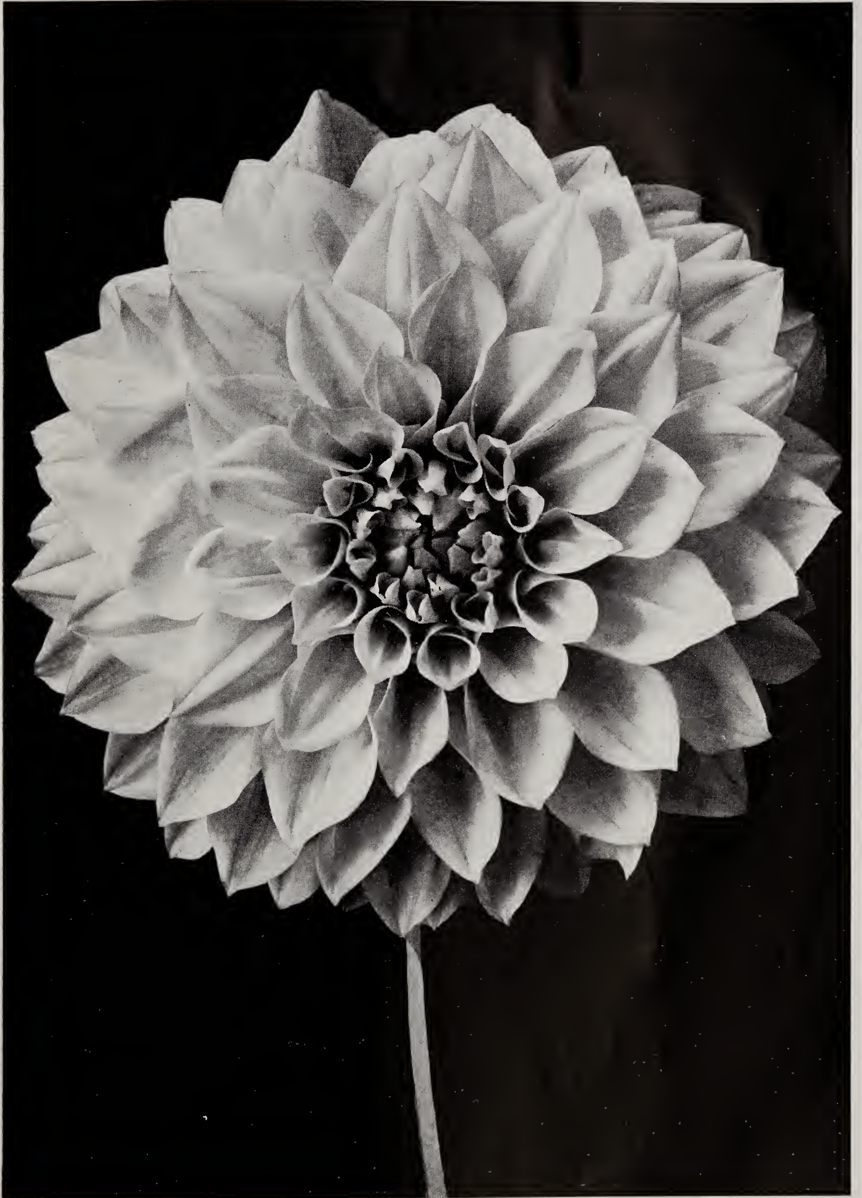
ST. HELENS MIST